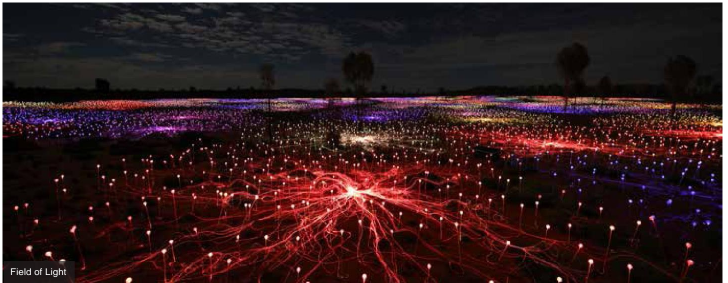
Field of Light

Discover Australia's spiritual heart on this four-day Ultimate Uluru adventure. See majestic Uluru and the magnificent domes of Kata Tjuta from the ground and the air. Marvel at the changing colours of these sacred sites from sunrise to sunset. Wander through the stunning art installation, Field of Light, and experience fine dining under a canopy of stars at an exclusive welcome dinner. Hear the stories of the Anangu people and learn about their culture.