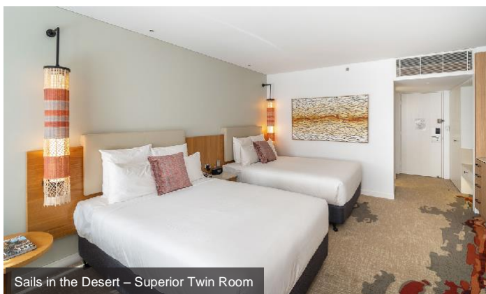
Sails in the Desert – Superior Twin Room