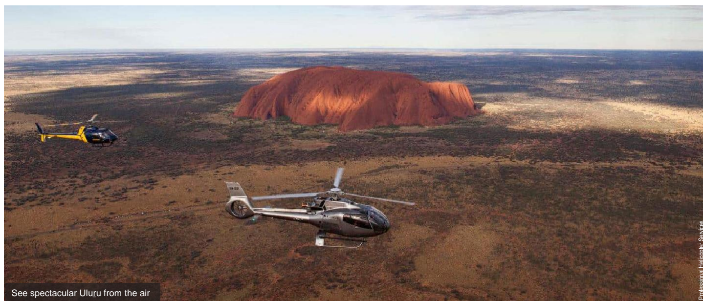
See spectacular Uluru from the air