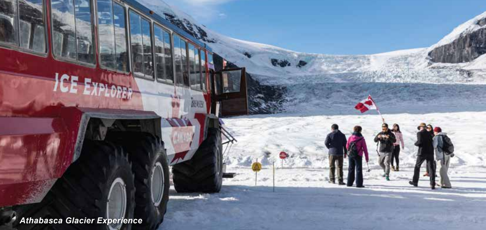
Athabasca Glacier Experience

Indulge in the ultimate Canadian Rockies experience during this extravagant journey through the heart of the most beautiful mountain scenery on Earth. After exploring Canada by land, board your Holland America cruise discovering the stunning coastal scenery of the Inside Passage and dramatic Alaskan coastline.