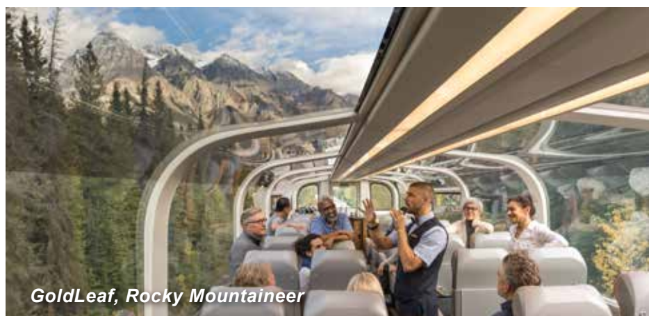
GoldLeaf, Rocky Mountaineer

This evening, you'll enjoy the chance to relax with dinner at one of the superb restaurants located within your hotel.