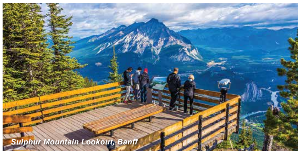
Sulphur Mountain Lookout, Banff