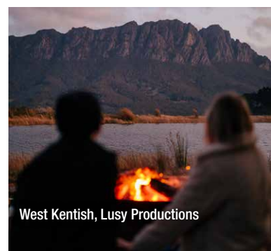
West Kentish, Lusy Productions