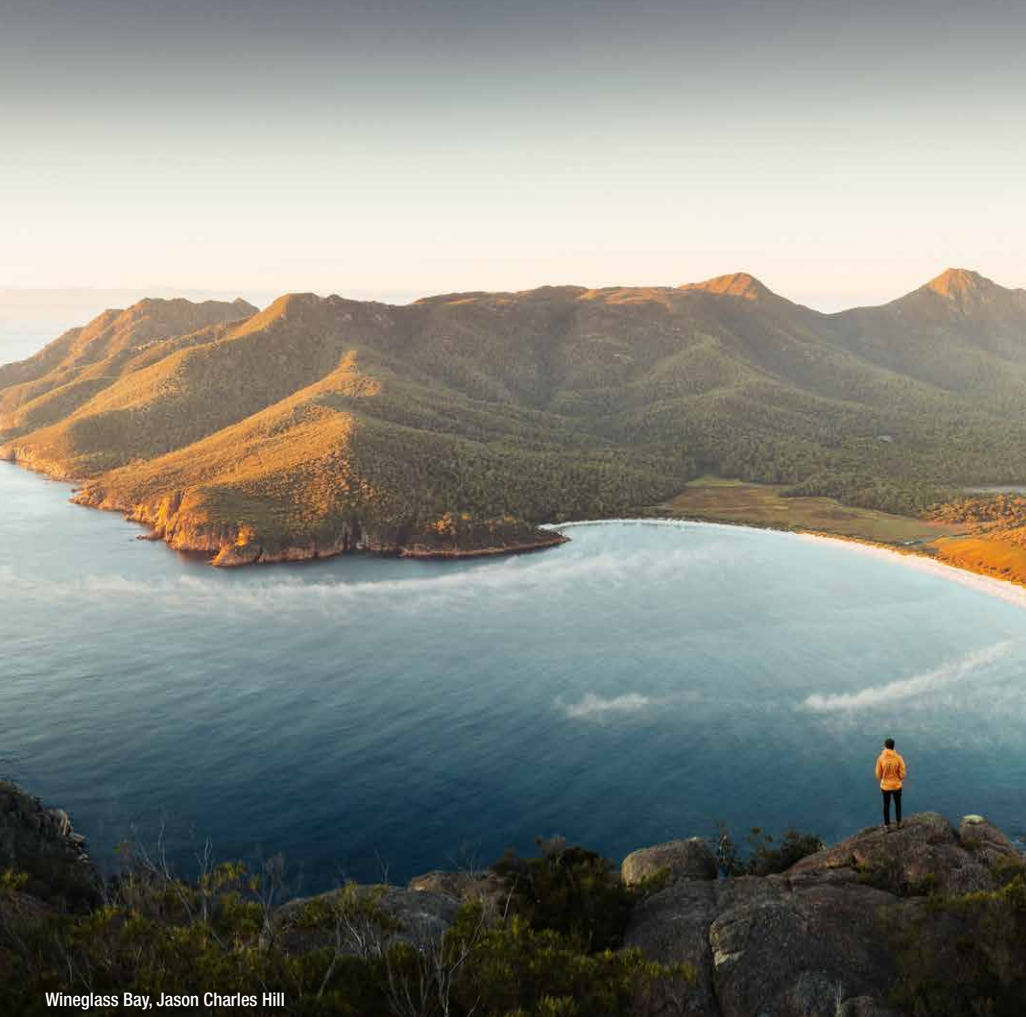
Wineglass Bay