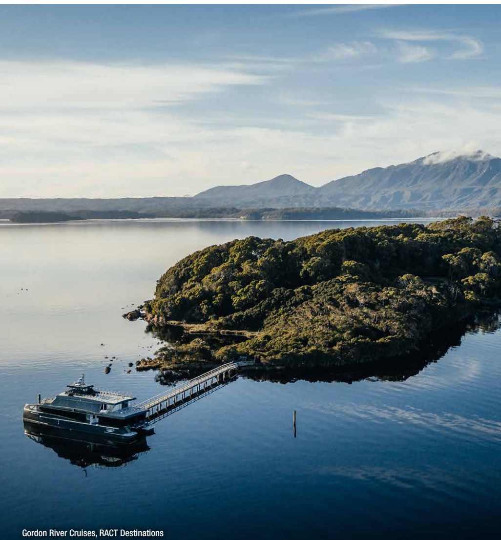
Gordon River Cruises, RACT Destinations