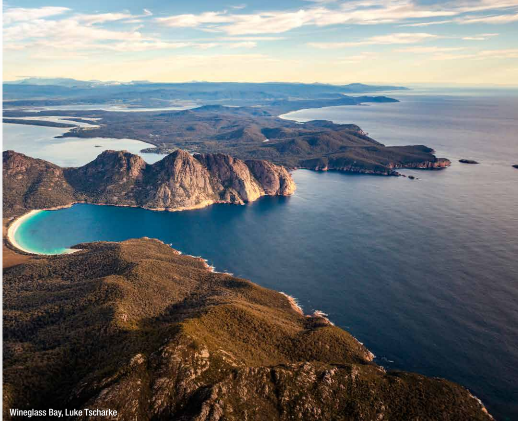
Wineglass Bay, Luke Tscharke