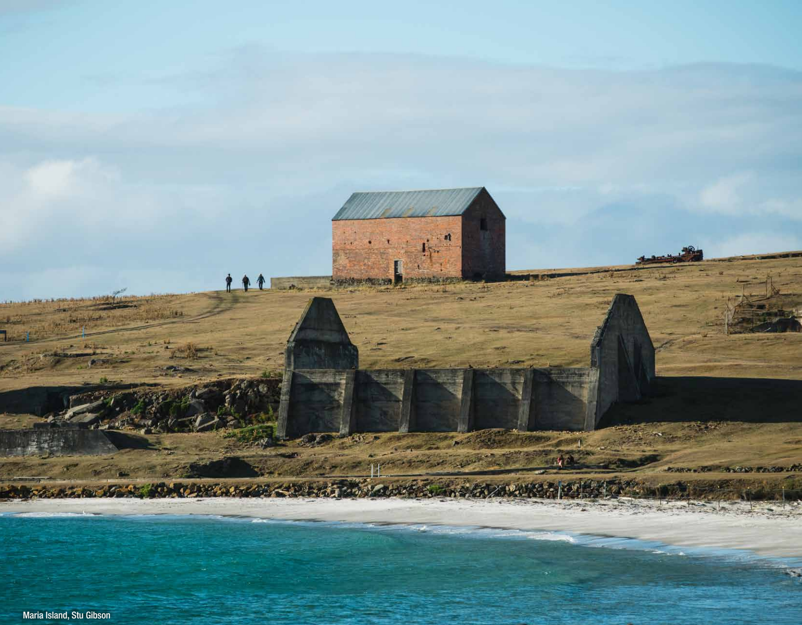
Maria Island