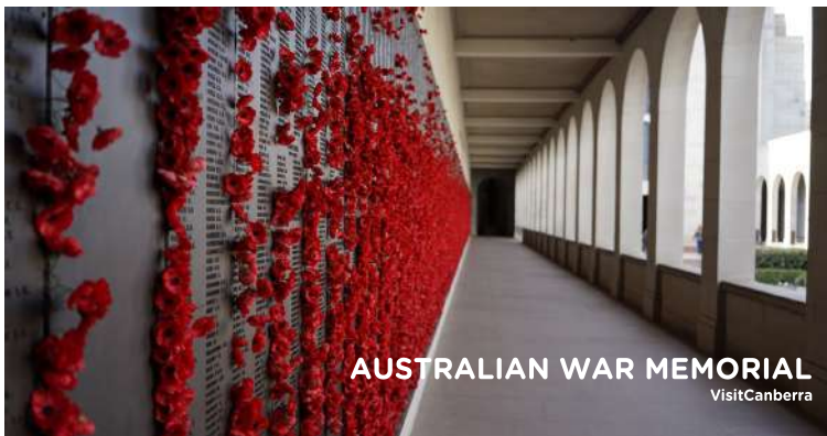
AUSTRALIAN WAR MEMORIAL VisitCanberra