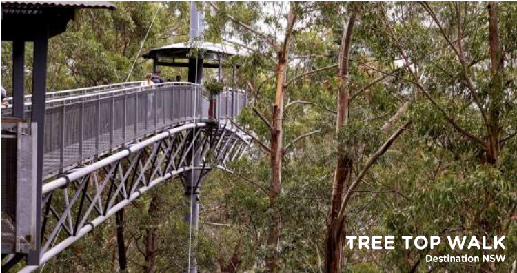
TREE TOP WALK Destination NSW