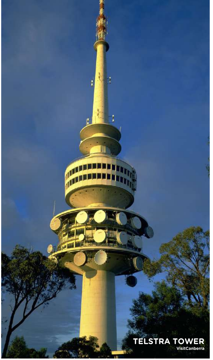
TELSTRA TOWER VisitCanberra