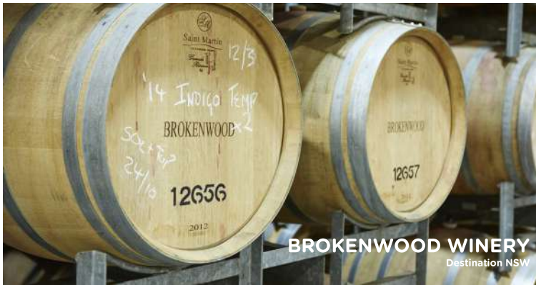
BROKENWOOD WINERY Destination NSW