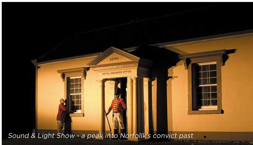
Sound & Light Show - a peak into Norfolk's convict past

After a hearty breakfast, we have the morning to relax or get in that last bit of shopping or sightseeing. We will be transferred to the airport where we depart on an afternoon flight taking us back home to Mackay via Brisbane.