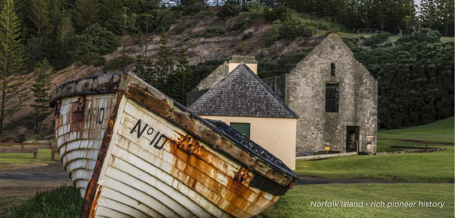
Norfolk Island - rich pioneer history

gardens. Through the morning we visit a nursery, owned and operated by a young Norfolk Islander, and view the hydroponics. We also visit a gorgeous private garden with a spectacular view. Morning tea at a scenic spot is included. Tonight, we have a fun night out with a beautiful 3-course dinner (included)! We dress as a convict (outfit supplied) and join in with the Commandant for an evening of gaiety, feasting, singing and dancing. Great food! Great fun!