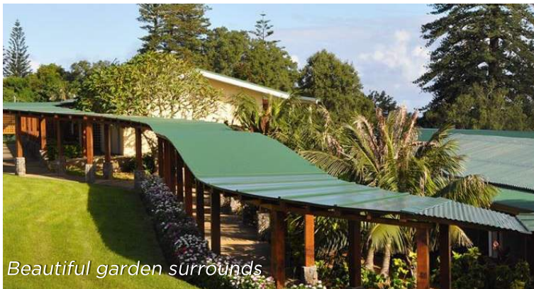
Beautiful garden surrounds

Surrounded by island style garden and valley, the Garden Room has everything you need to relax and make the most of your Norfolk Island getaway. Standard rooms with King beds (can split to two singles if requested) or Double and Single beds, large verandah shared with neighbour.