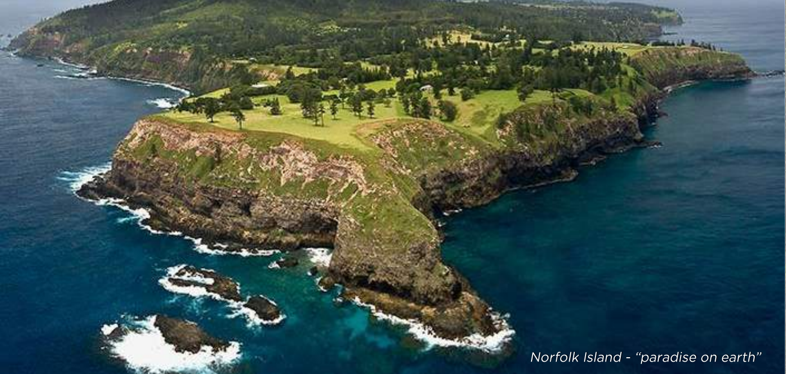
Norfolk Island - "paradise on earth"

Norfolk Island is an idyllic island paradise positioned between Australia, New Caledonia and New Zealand. Described by Captain James Cook as "paradise on earth", this lush island boasts sandy beaches, jagged cliffs and is the home of mighty araucaria pine and a remarkable variety of birds. Norfolk's rich colonial history and Polynesian influence has shaped this small community and the locals are proud to share their home with you. Take in the breath-taking scenery, learn about its rich historic past and enjoy the many activities on offer.