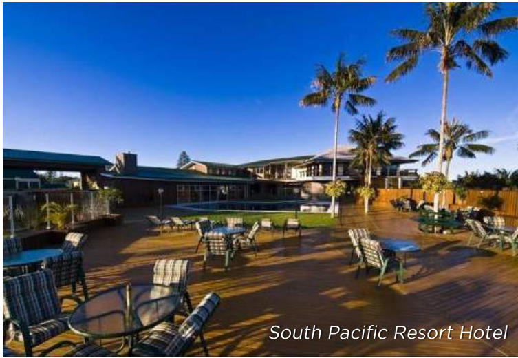
South Pacific Resort Hotel

Your accommodation is set in 5 acres of beautiful landscaped gardens - the newly renovated South Pacific Resort is the largest and most conveniently located hotel on Norfolk Island. Just a brief walk to the main shopping township of Burnt Pine and only a short drive to historical Kingston, beautiful Emily Bay and the golf course, the South Pacific Resort is the perfect place to relax and unwind on your Norfolk Island holiday. Hotel facilities are extensive and include a swimming pool, hot tub, coffee shop, bar, restaurant, conference facilities, games room, computer room and a free scheduled