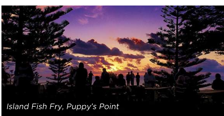
Island Fish Fry, Puppy's Point