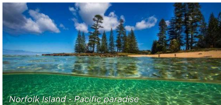
Norfolk Island - Pacific paradise

Let us make your dream holiday a reality today!