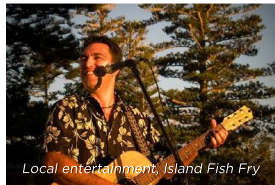
Local entertainment, Island Fish Fry

Tonight, we enjoy a 3-course meal progressing to different Norfolk Island family homes. We will join a group of other Norfolk Island visitors and be taken to carefully selected island homes where we will hear Norfolk stories from our dinner hosts. The Progressive Dinner is a fun night and a great way to meet the local people.