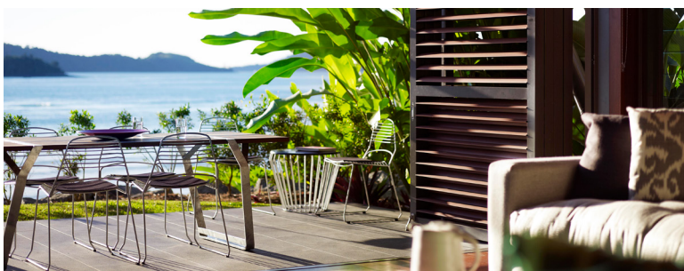
Yacht Club Villa

Max. room capacity: 2 people (Leeward and Windward Pavilions), 4 people (Beach House)