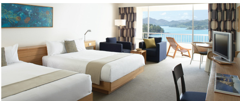
Coral Sea View Room, Reef View Hotel

Max. room capacity: 2 adults and 2 children 12 years and under