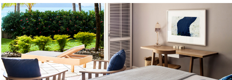
Beach Club Room

Max. room capacity: 4 people (Garden View and Coral Sea View Rooms), 2 people (King Coral Sea View Rooms and Reef Suites), 6 people (Reef Family Room)